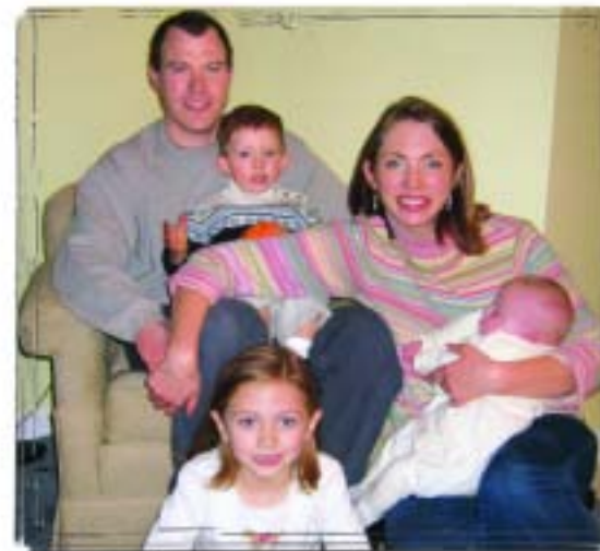
The Amick family